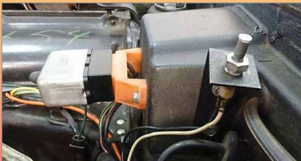
Fig. Ch 6.3 SX pin-style alarm switch

The original switch is zinc or silver cadmium with SX stamped in the top of the plunger. For a full discussion of the two plunger-style switches used in 1973 and 1974, see Section 9, Door Jambs in the Interior Section.