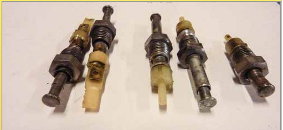
Fig. I 9.1 Spade-style switch vs. pin-style SX switch