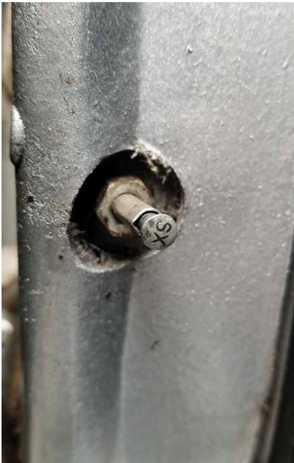
Fig. 1 9.0 Door jamb switch w/SX stamp and barrel crimp

While the layout is typical of any NCRS judging manual, the 1973-74 adopts a format to shape it as a field-friendly judging guide that includes at the front of each section both a detailed Table of Contents and List of Tables. The